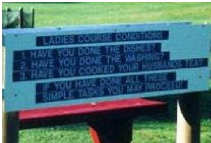
No such sentiments at Sea View!

Congratulations to all who have played in the competition, particularly the 9 hole girls for whom this was a brand new experience.